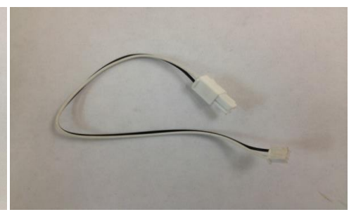
Figure 3: LED Light Primary Connection Wire (120V) – 1 pc