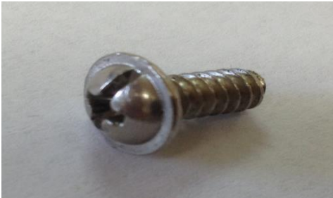
Figure 5: Screw – 4 pcs