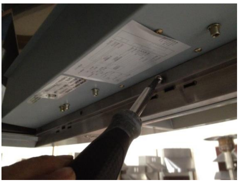
Figure 8: Halogen Lamp Transformers