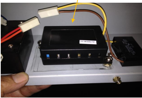
Figure 12: LED Driver Mounted

E. Place LED light driver on the location where original transformers was. Initially, there were two halogen lamp transformers. After converting to LED lights, there should be one LED light driver only. The driver should be mounted on the original transformer spot (which is closer to the circuit board).