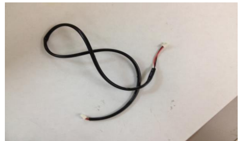
Figure 4: LED Light Secondary Connection Wire - 3 pcs