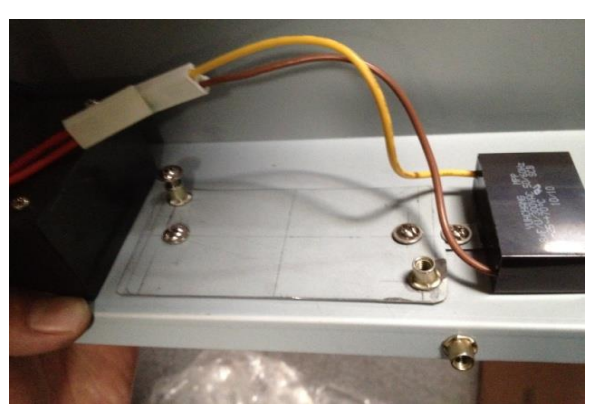
Figure 10: Mount Bracket on Transformer Location