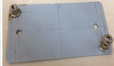
Figure 6: 'C Type' LED Driver Support – 1 pc