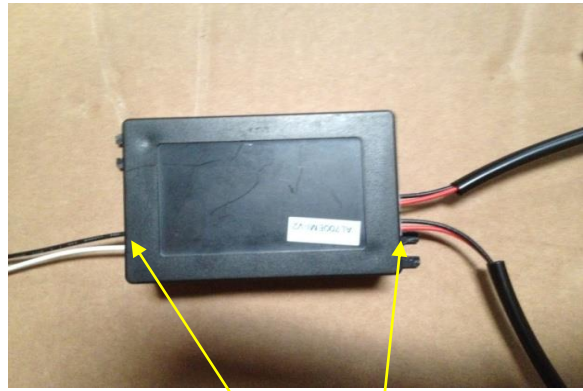
Figure 11: Mount LED Drive on Bracket

Note: On figure 11, the end with two wires connected will be called the "secondary side". Connect these wires to the LED light. On the other end, there is only one wire connected; this wire will be connected to the 120V on the processor board. This end will be called the "primary side".