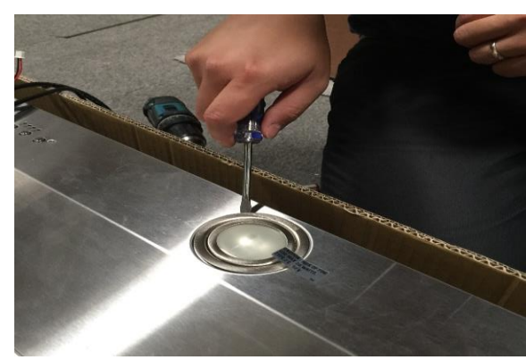
Figure 15b: Alternate Lamp Removal