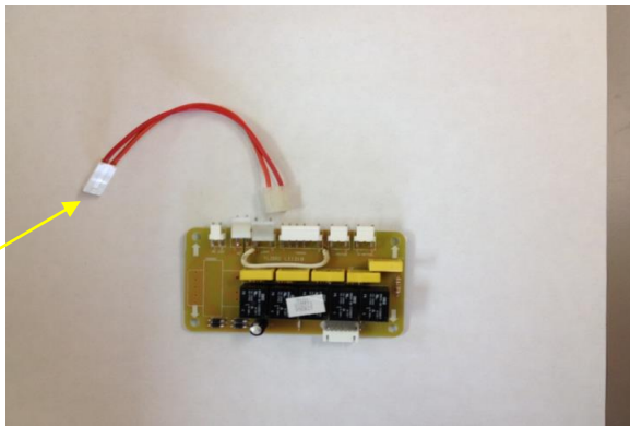
Figure 14: Wire to the Circuit Board

Note: The connector can be found inside the hood. This was removed from the halogen lamp transformer.