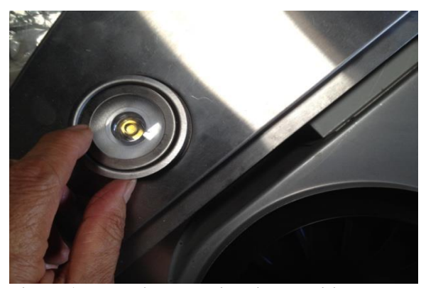
Figure 17: Push in LED Light into Position