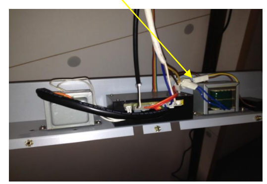
Figure 9: Transformer Location