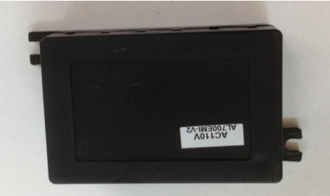
Figure 2: LED Driver - 1 pc