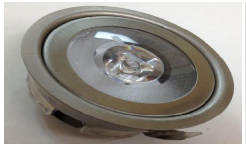
Figure 1: LED Light - 3 pcs