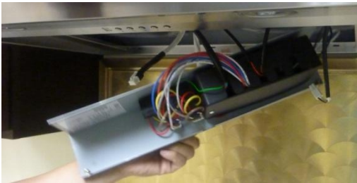
取出装电路板的盒子 ( Pull out processor board box )