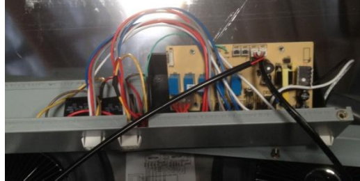
打开盒子取出电路板 ( Open Box, take out processor board )