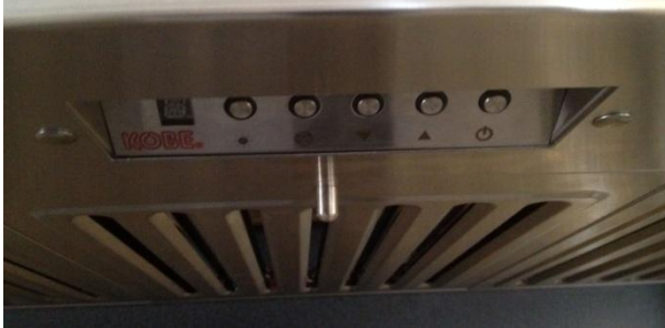
开关斜装的机型 ( Switch Tilted )