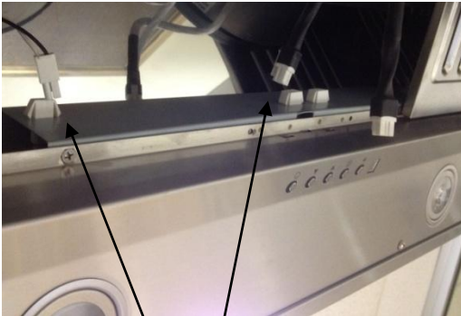
拔掉风机和电源插头 ( Pull out Power Plug and Blower plug )