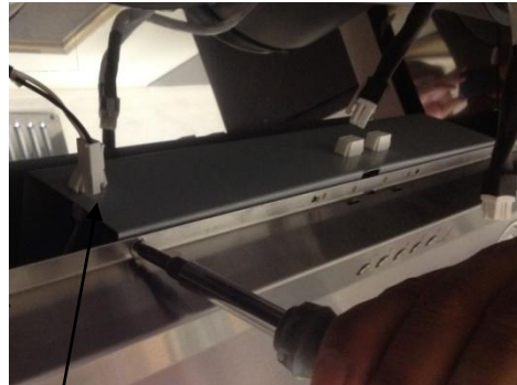
拧螺丝, 拆下装电路板盒的铁板 ( Disconnect processor board box panel )