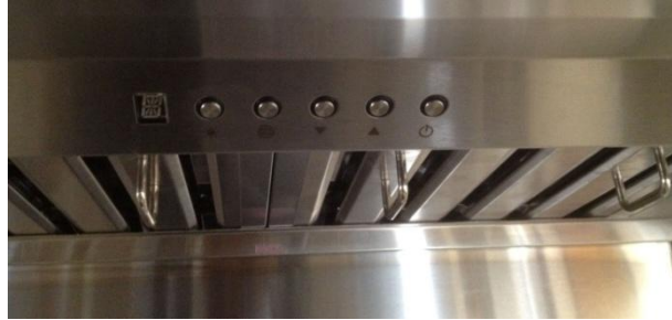
开关平装的机型 ( Switch Level )

装 6 速电路板的机器开关有两种, 一种是平装, 另一种是斜装。电路板都在装开关的板的后面。